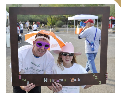
The day remembered with a portrait.

Congratulations to all that attended the walk! Thank you to all our volunteers that generously gave their time to make the event so special.